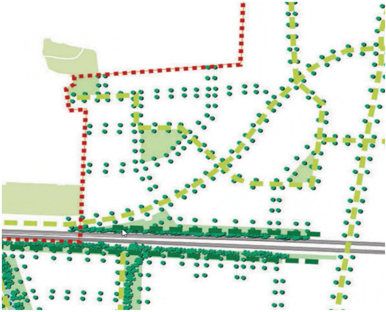
SDZ Green infrastructure

'... green spaces will take the form of parks, open spaces, constructed wetlands, swales, tree planting, hedgerows, parks, permeable paving, green roofs and a green bridge over the railway line. These spaces will provide for amenity and recreation, biodiversity protection and enhancement, water management and adaption to climate change. In general, the recreation and amenity spaces should all be overlooked by buildings and streets that would provide passive supervision from residents, pedestrians and passing motorists where appropriate.'