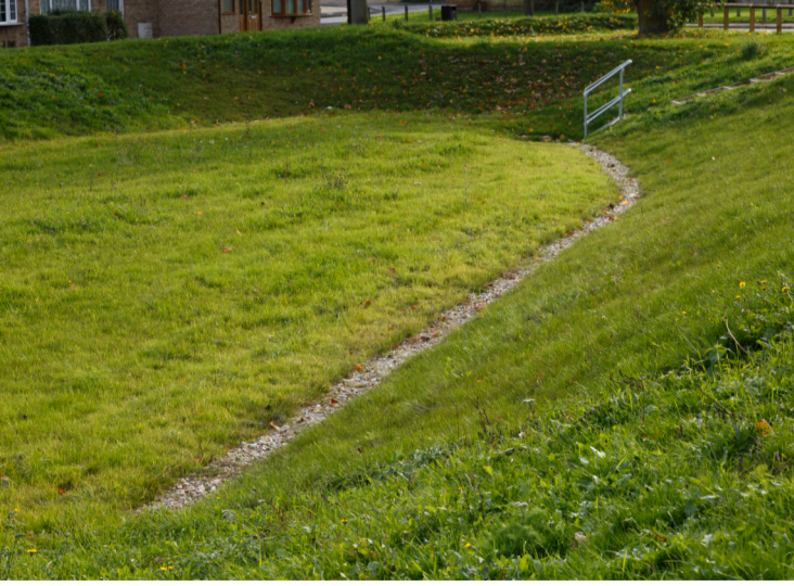
Example of SuDS and attenuation areas